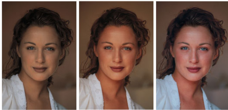
Warm White 3000k - 52 CRI

an object. CRI rates light sources on a scale of 0 to 100 with higher CRIs being closer to the natural color of objects. 80+ CRI is considered excellent.